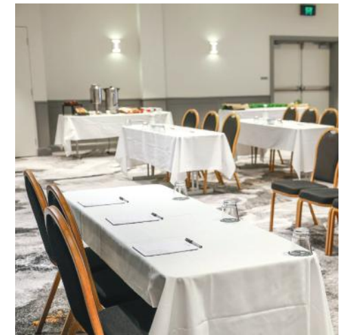
THE ANTLER ROOM