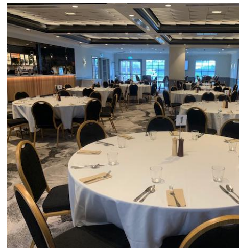
THE ANTLER ROOM